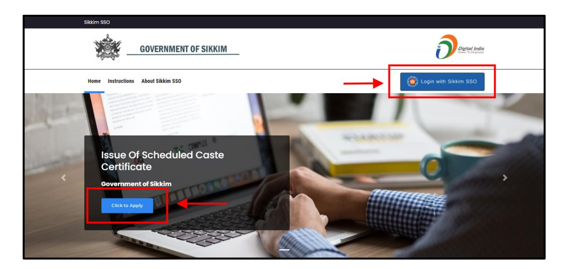
Figure 1: Sikkim Go Portal with Single Sign on System.

Click on login in bottom as illustrated in the given Figure 1.